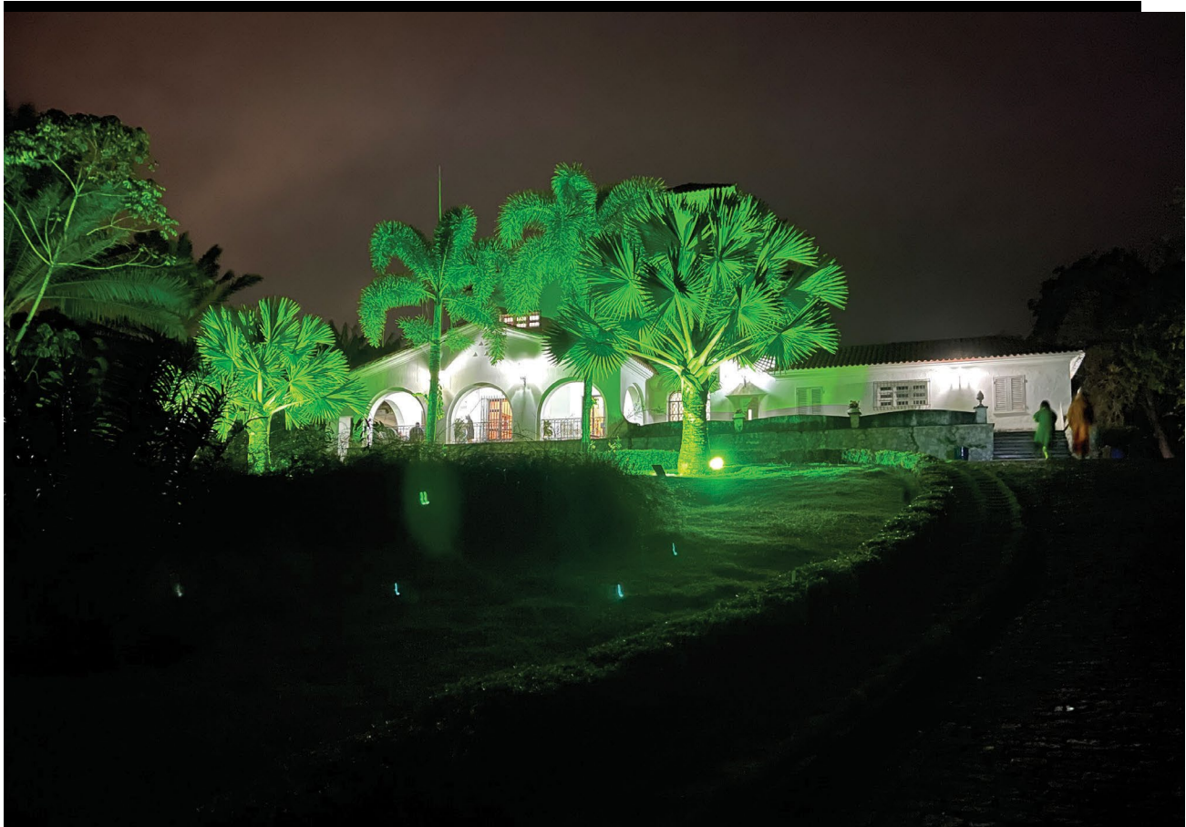
ABOVE Casa do Lago.